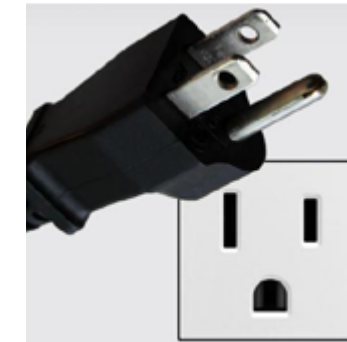
Type B plug

In Canada, there are two plug types, types A and B. Plug type A is a plug that has two flat parallel pins. Plug type B is a plug that has two flat parallel pins and a ground pin. Canada operates on a 120V supply voltage and 60HZ.