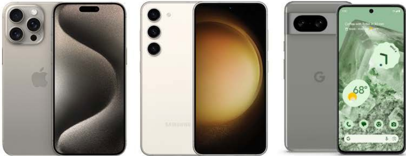
iPhone 15 Pro

Exclusive offers on devices for students